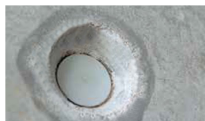
No additional finishing or after-treatment required