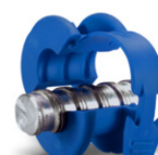
SEALING CONNECTOR WITH CLOSING STRIP

The water swellable sealing products by BeSealed® are based on the unique Active Sealing technology. Our products expand on contact with water. This is how they create an active seal to combat moisture infiltration. The BeSealed® products are self-correcting and thus also sealing the unevenness and imperfections of the concrete. BeSealed® is a registered trademark and a brand of Bekina® Compounds nv.