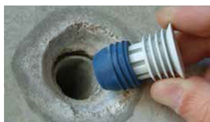
Position the Sealing Plug in the formwork spacer

The Sealing Plug fits in spacers with an inner diameter of 22, 24 or 26mm and can be customized to your specific formwork.