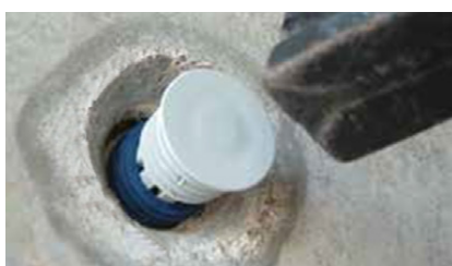
Hammer the Sealing Plug into the formwork spacer